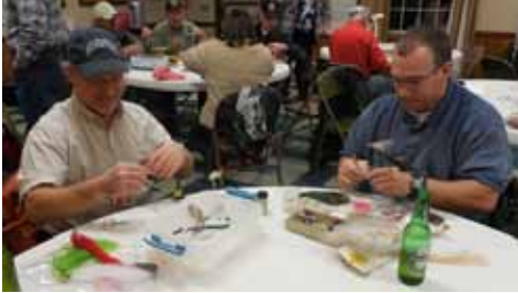
Some amazing flies were tied by some talented members. Keep tying, guys!

At our December meeting we had an amazing turnout of members who came and tied flies for this year's charity, SAVE THE BAY. Well over 100 flies were tied and donated at our annual 'Fly Tying Extravaganza'. Thank you to all who participated.