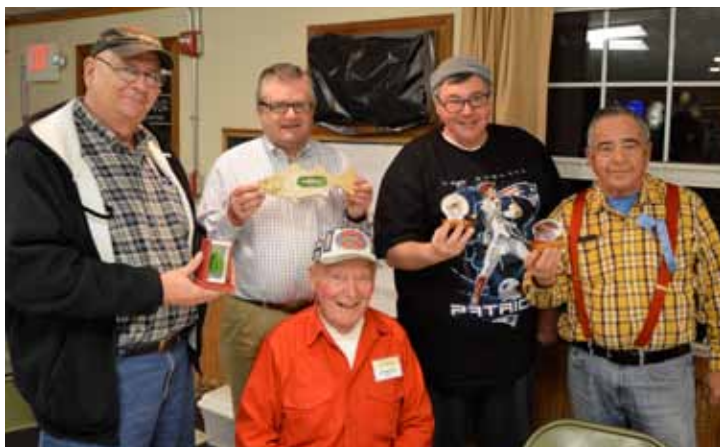
Santa (in red shirt) poses with the 4 lucky little boys that held the lucky raffle tickets, for the wonderful 'fly gifts' from Santa's workshop. Santa outdid himself this year with 4 wonderful prizes.

Providence Convention Center– Feb 27th, 28th, March 1st