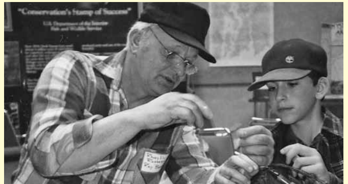
Continuing the 'guess who' person of the month feature - A lifetime member of Rhody, loves to fish and tie flies. He has a famous fly named after him. (answer on these pages)