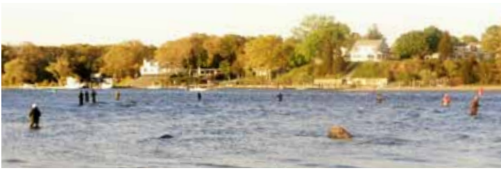
The May fishing meeting at Bristol Narrows. 15 members- 1 fish!