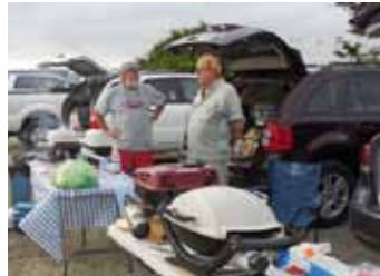
Looks like some sort of fancy banquet hall!