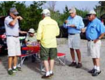
Yes, the memo said...hats, shirts, shorts, white socks & sneakers!