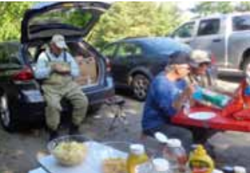
What you do when's there's no fish? Eat, what else!