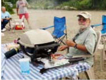
A private table...with his own grill! Must be an important guy!