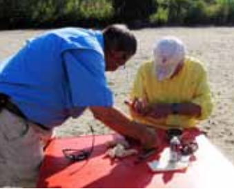
Oh, no! There goes the spring from my reel! Nobody move!