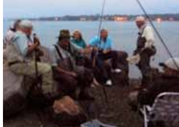
A group gathers after our fishing at Quonny. "So where's the fish?"