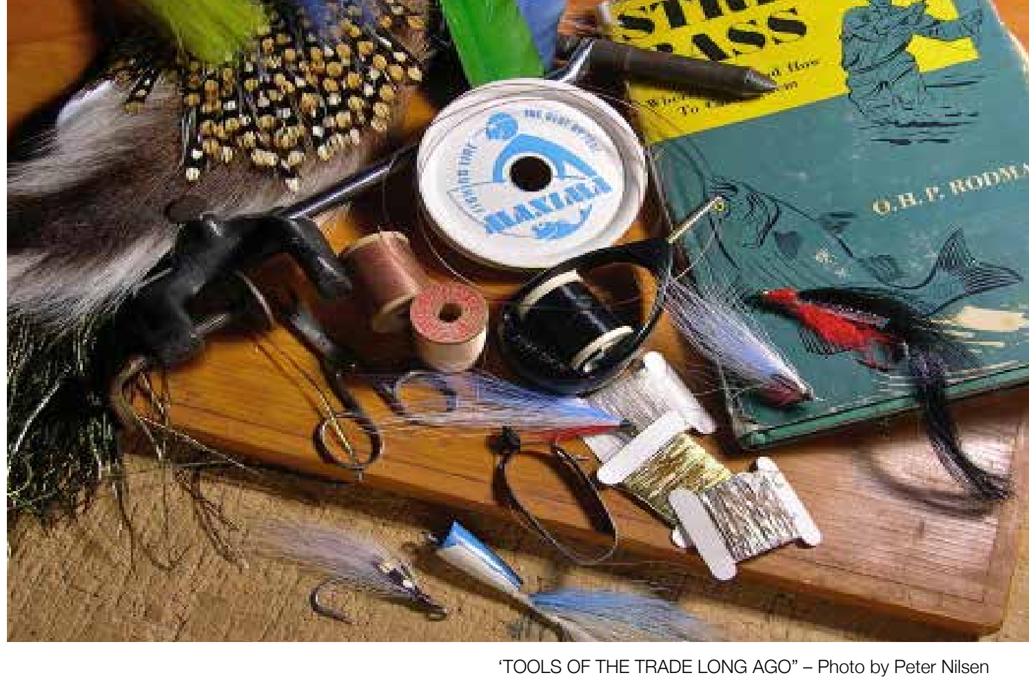
"TOOLS OF THE TRADE LONG AGO"